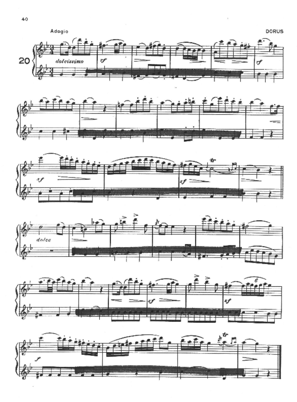
Rubank Advanced Method for Flute, Vol. 1: page 40, #20 (top). = 58-62.